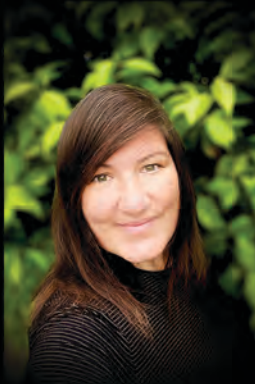
Danelle Frisbie Photographer / Videographer Playbill Designer