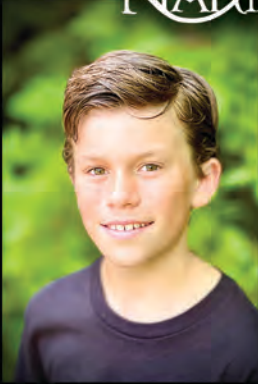
Aiden Solomon Dwarf / Narnian Creature