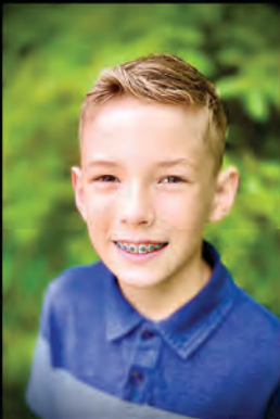
Benjamin Iumin Dwarf / Narnian Creature