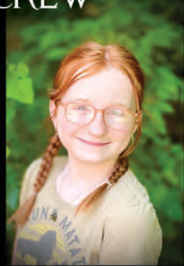
Lily Sarvis Lucy Pevensie / Narnian Creature Backstage Crew