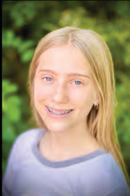
Kara Savery Owl / Door