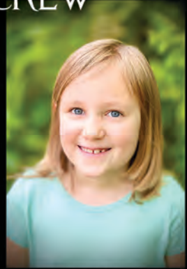
Arden Harrod Cute Puppy