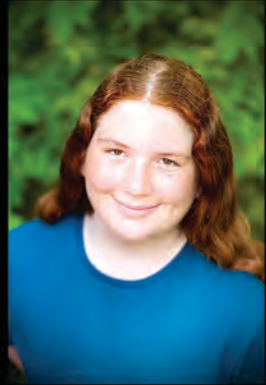
Juneau Frisbie Baade Bull / Polar Bear