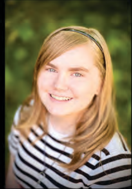
Isabella Castello Skunk / Narnian Creature Backstage Crew