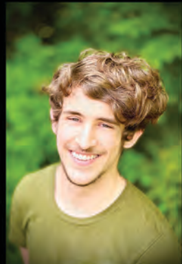
Seth Sheppard Tumnus / Cruelie